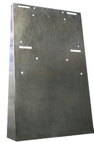
58.106.1 Universal Mounting Bracket Accessory (Mounts on top of dishmachine)