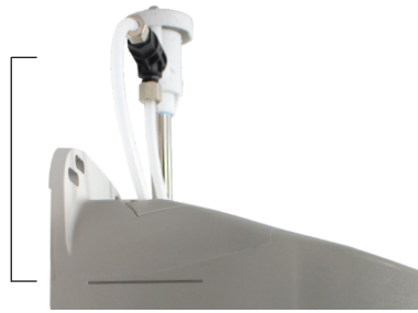
Molded Flood Line Shows acceptable distance to vacuum breaker