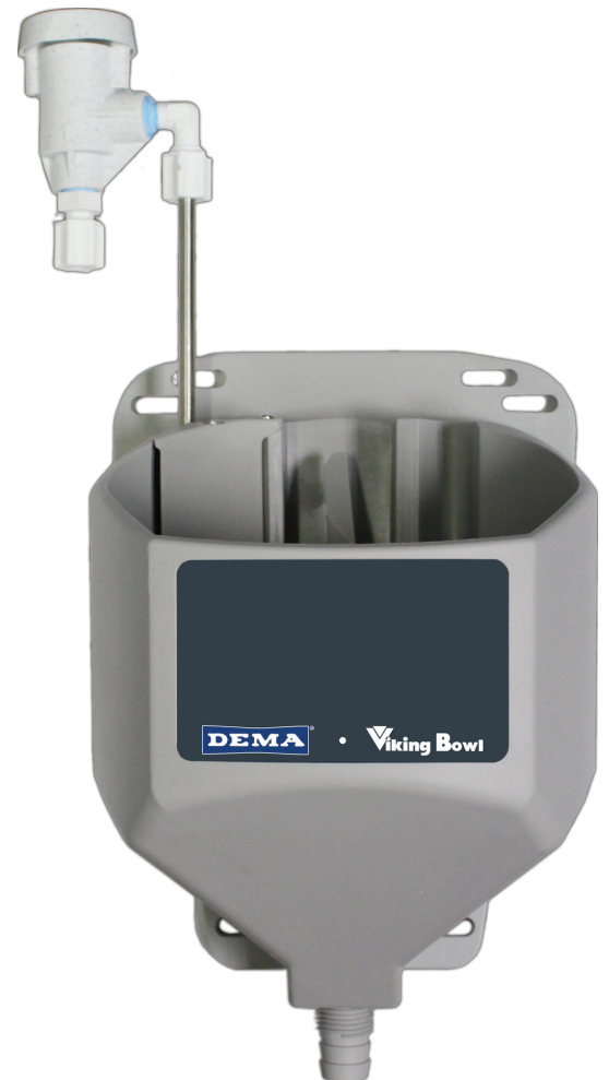
5801V Sink Bowl