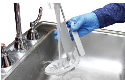
Spray Assembly Easy to Remove for Cleaning