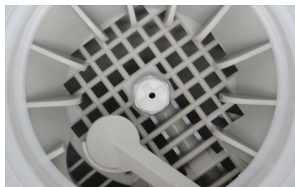
Spray Guard Open Chemical Capsule Installed