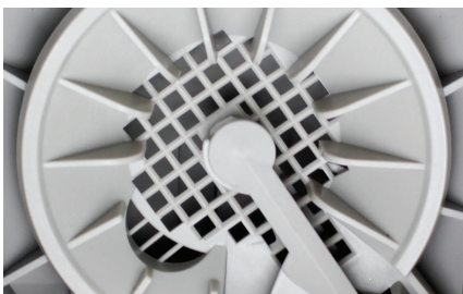
Spray Guard Closed No Chemical Capsule